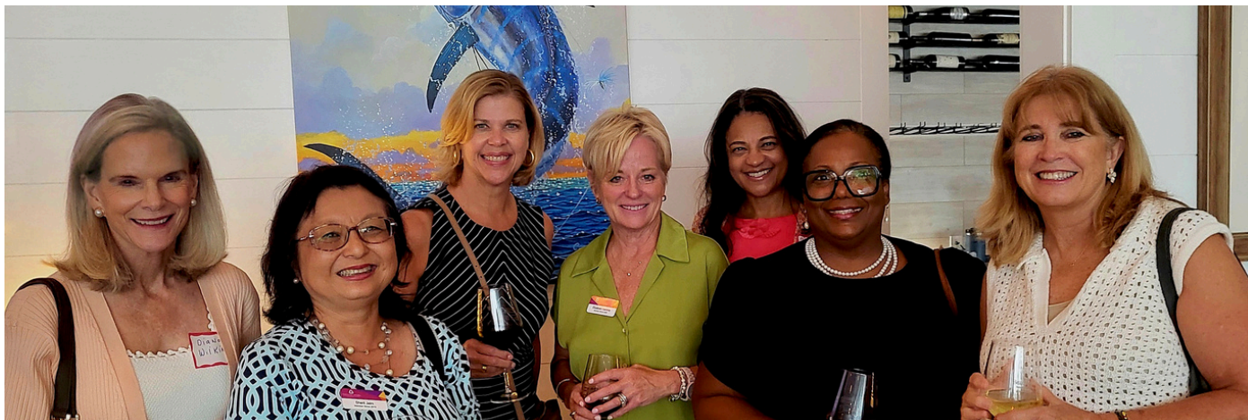
Dinner Bunch- July 31st, Seminole Reef Grill

The official newsletter of the Executive Women of the Palm Beaches Foundation