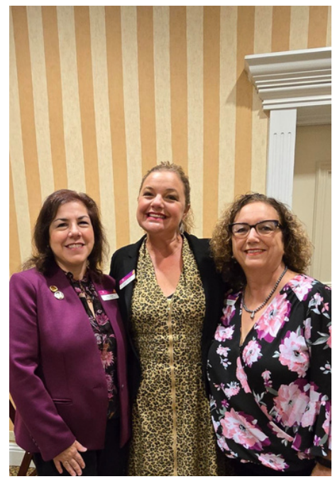
For more photos visit: ewpb.org