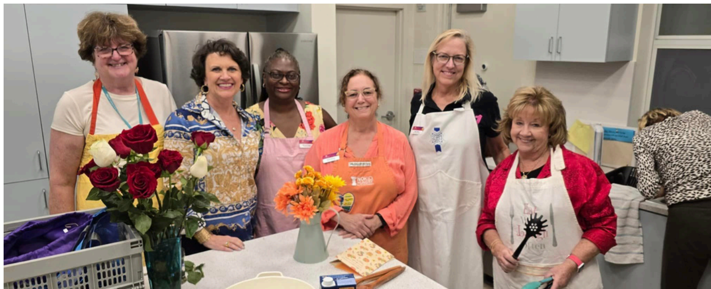
Community Outreach Event: The Lord's Place

The official newsletter of the Executive Women of the Palm Beaches Foundation