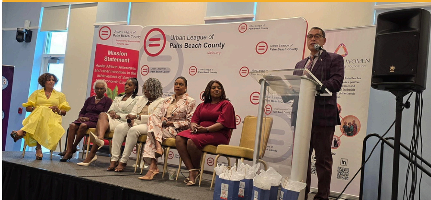
Trailblazers: Celebrating the Achievements of Black Women in Palm Beach County

The official newsletter of the Executive Women of the Palm Beaches Foundation